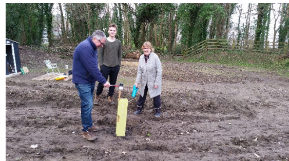
Volunteers planting native trees.