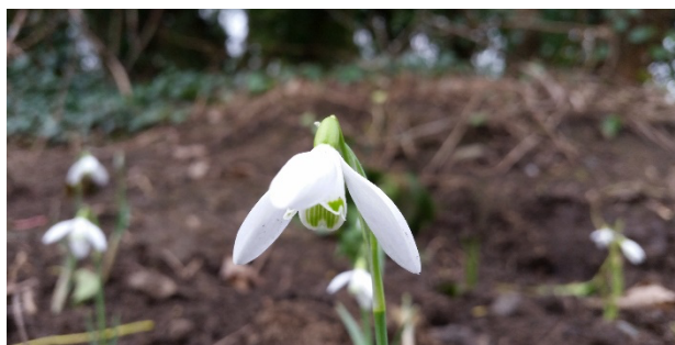
Snowdrop bulbs flowering.