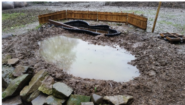
Pond and marsh area.

The Sustainable Mumbles Urban Green Spaces project in Norton has undergone some significant developments this month. This project A line of over 20 metres of native trees have been planted, which will be grown and shaped over time into a hedgerow around the perimeter of the site. A variety of native bulbs have been planted, including bluebells, Tenby daffodils, snake's head fritillary and snowdrops. The snowdrops have started flowering, and we expect the rest to flower over the next couple of months. The pond and marsh area have been filled by recent rainfall. Native pond plants will be planted shortly. A wildlife feeding station has been created, providing food for local birds, squirrels and hedgehogs. The food growing project on site has also progressed, with raised beds and starter seeds purchased for each of the community groups who are collaborating with us for this project. Photographs from the site can be seen below.