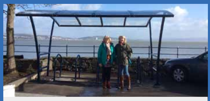
New bike rack next to Oyster Wharf Piazza

We are aiming to help to reduce pollution in and around Mumbles from exhaust fumes.