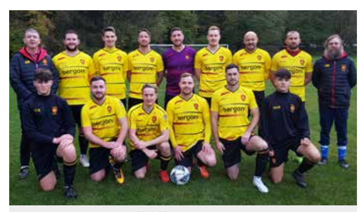
Mumbles Rangers First Team 2019-20

We also want to make this a place that the general community can come and enjoy watching good quality sport on the weekends. Teas and coffees together with snacks will be available from the club and we will also have exciting new bespoke merchandise available. Our leisurewear catalogue will launch at the start of the new season.