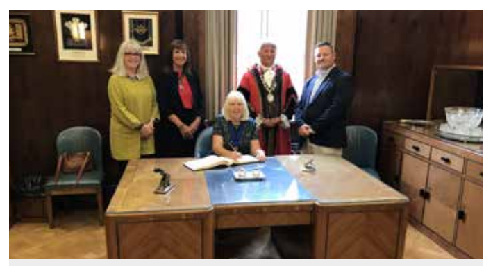
Charter Signing Ceremony

Twenty American visitors from Hayre de Grace, Maryland, arrived in Mumbles on 5 September for a five-day visit to mark the start of a new twinning relationship between the two communities.