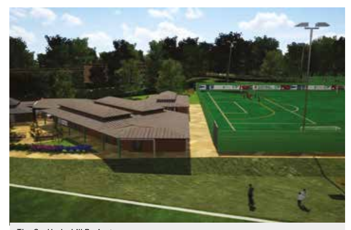
The Go-Underhill Project

The Go-Underhill project, which will deliver brand new changing rooms and an all-weather pitch, has taken a huge step towards becoming a reality. Mumbles Community Council (MCC) has decided to enter into a Community Partnership with Mumbles Community Association (MCA), the organisation driving forward the development of Underhill Park, to make sure that the much needed new facilities in the Park can get underway.